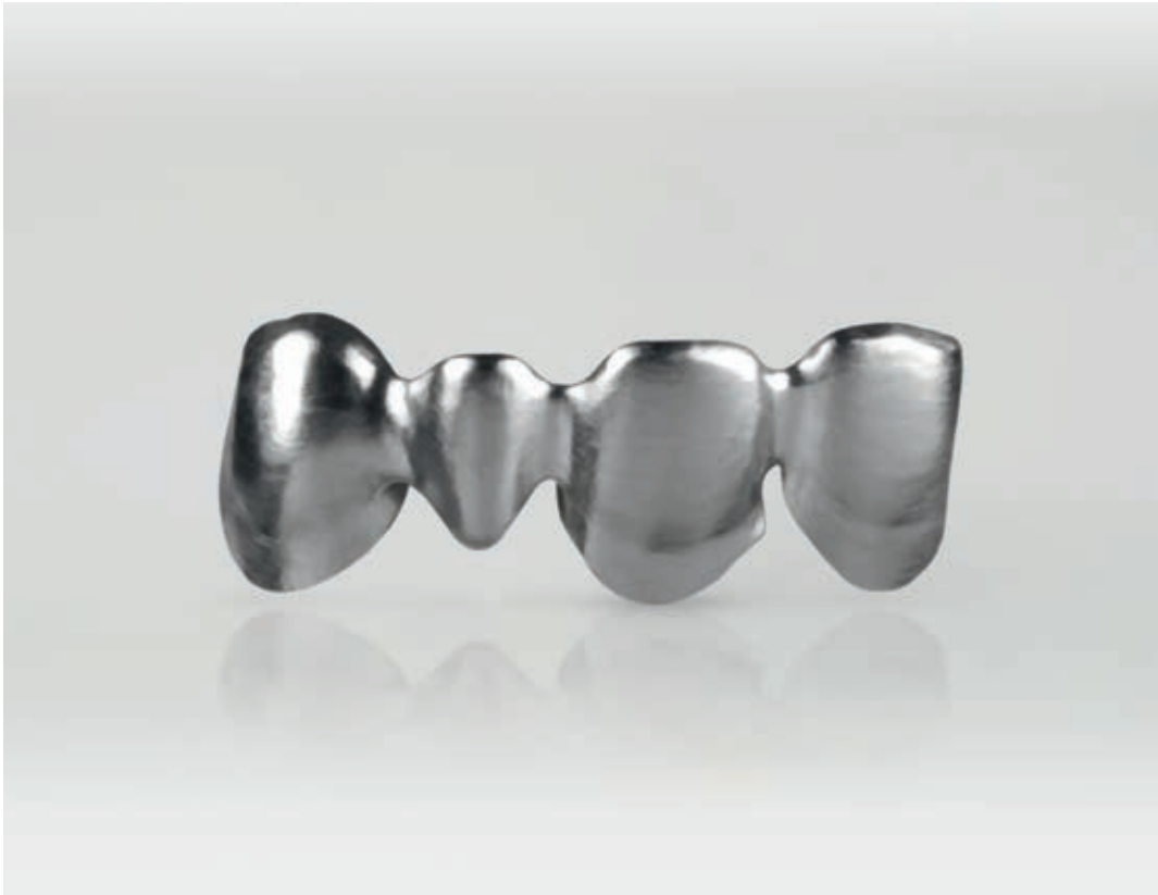
Fig.11: Polished bridge made from EOS CobaltChrome SP2