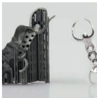
Fig. 3: Removable partial denture

It doesn't matter whether you are producing crowns and bridges, plastic dental models or removable partial dentures, with EOS solutions you always get exceptional value for money. Laboratories and manufacturing services providers can thus work much more efficiently. The productivity of the EOS systems has a positive effect on the cost of parts and the quality of the final products is reliably high.