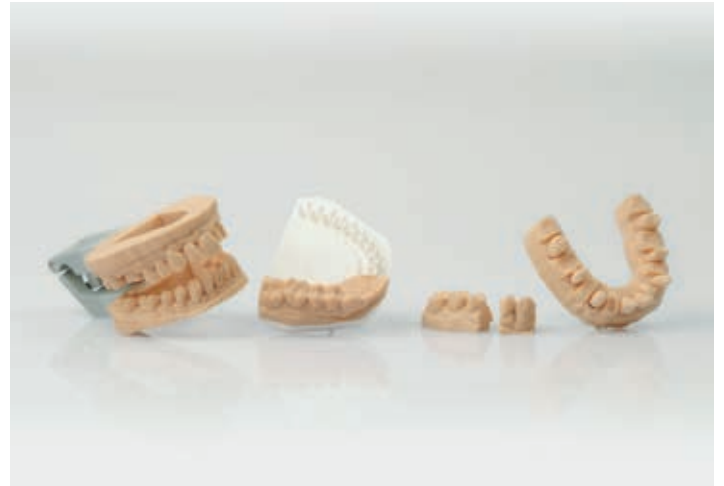
Fig. 6: Design variety thanks to digital production: Complete jaw model in form of a solid piece to check for occlusions, saw-cut model with pinholes, model with removable stumps (left to right)

The plastic model is primarily used for ceramic veneers, to check for occlusions and to adjust the interproximal contact points. The fit of the crown margin is ensured by the CAD/CAM procedures and should only undergo a visual check. Anatomic impressions for analysis, on the