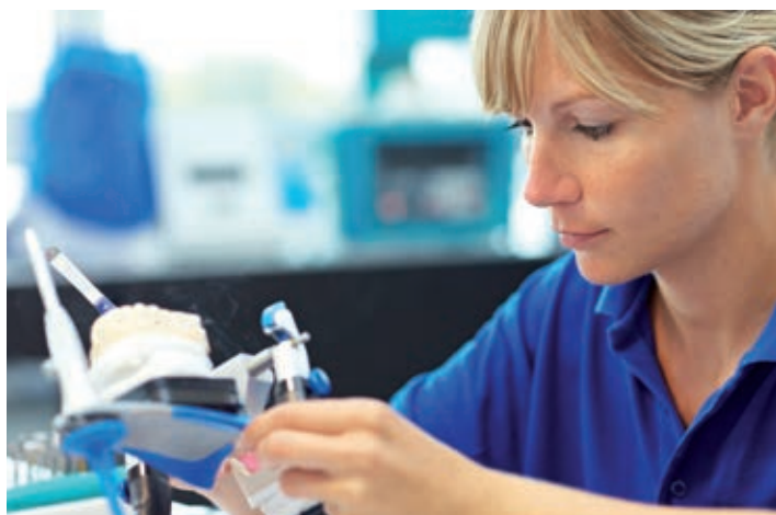
Fig. 4: In the dental laboratory: Digital technology meets traditional craftsmanship

Digital technologies have become established in several fields of dentistry and are already a firm part of the industry. Laser sintered dental prostheses have almost completely replaced precision casting in some countries. A further stage in the process has been digitised with the optical impressions, and more will follow. In future, more and more dental technicians will thus pick up a computer mouse instead of a wax knife and use an intraoral scanner instead of an impression tray – this saves time and makes work processes more efficient.