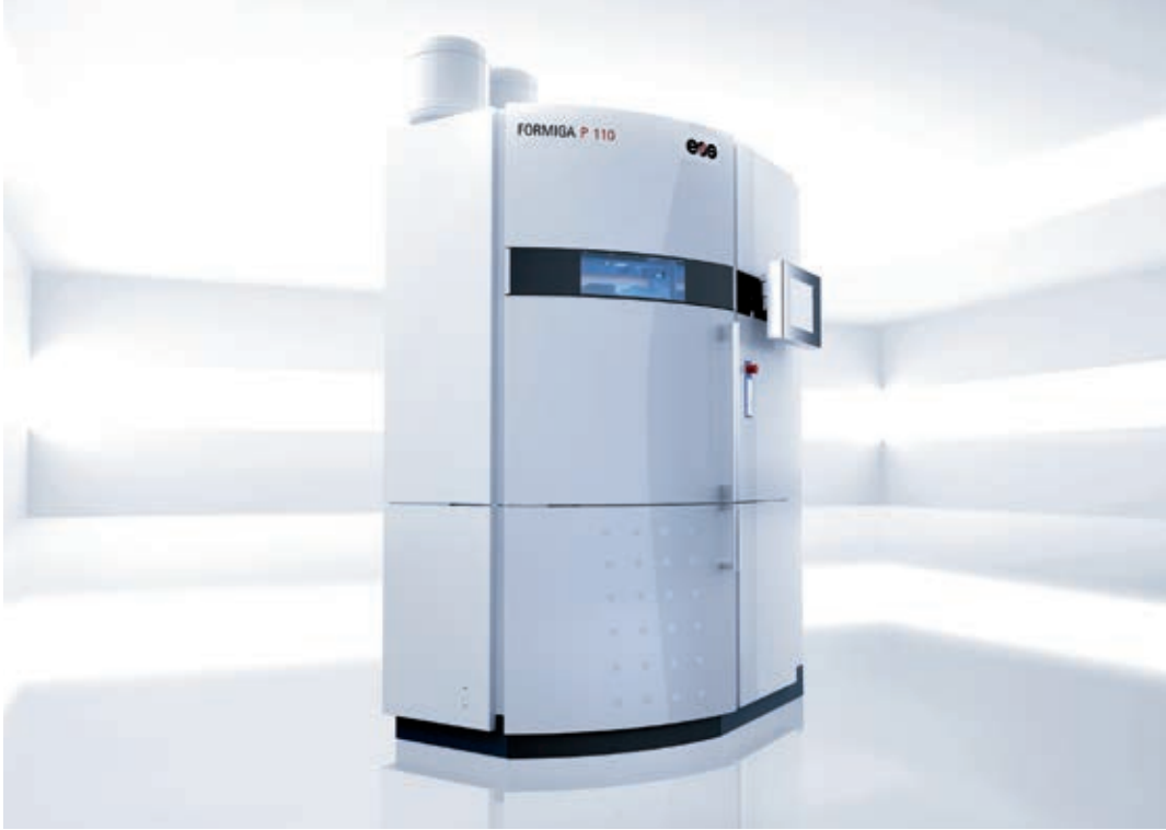
Fig.10: FORMIGA P 110: System for the Additive Manufacturing of dental models directly from electronic data

The system produces a number of different dental models in only a few hours with an overall building volume of 200 x 250 x 330 mm and in several consecutive layers. The productivity of the system has a positive effect on the costs per part and the quality of the final products is reliably high. Thanks to its efficiency and flexibility, the FORMIGA P 110 can be ideally integrated into the workflows of a dental laboratory. All of this for a relatively low investment cost.