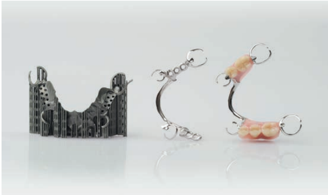
Fig. 7: Stages of production for a laser sintered removable partial denture: Dental prosthesis directly after manufacturing, with support structures removed and surface polished, after completion (left to right)