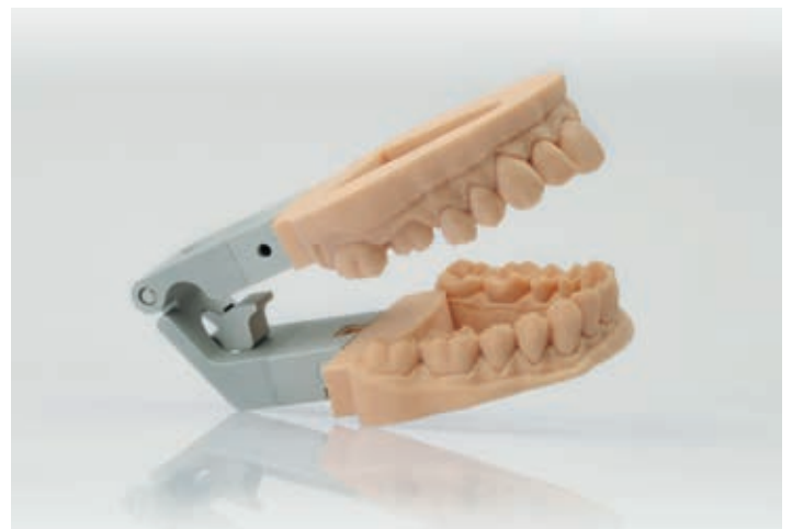
Fig.13: Dental model made from PA 2105 in the form of a solid complete jaw model to check for occlusions

EOS systems are able to manufacture medical devices. However, EOS cannot offer any guarantee that these devices meet all requirements