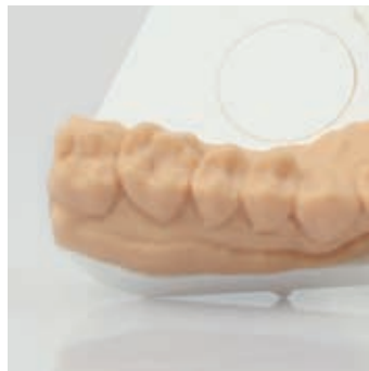
Fig. 2: Dental model