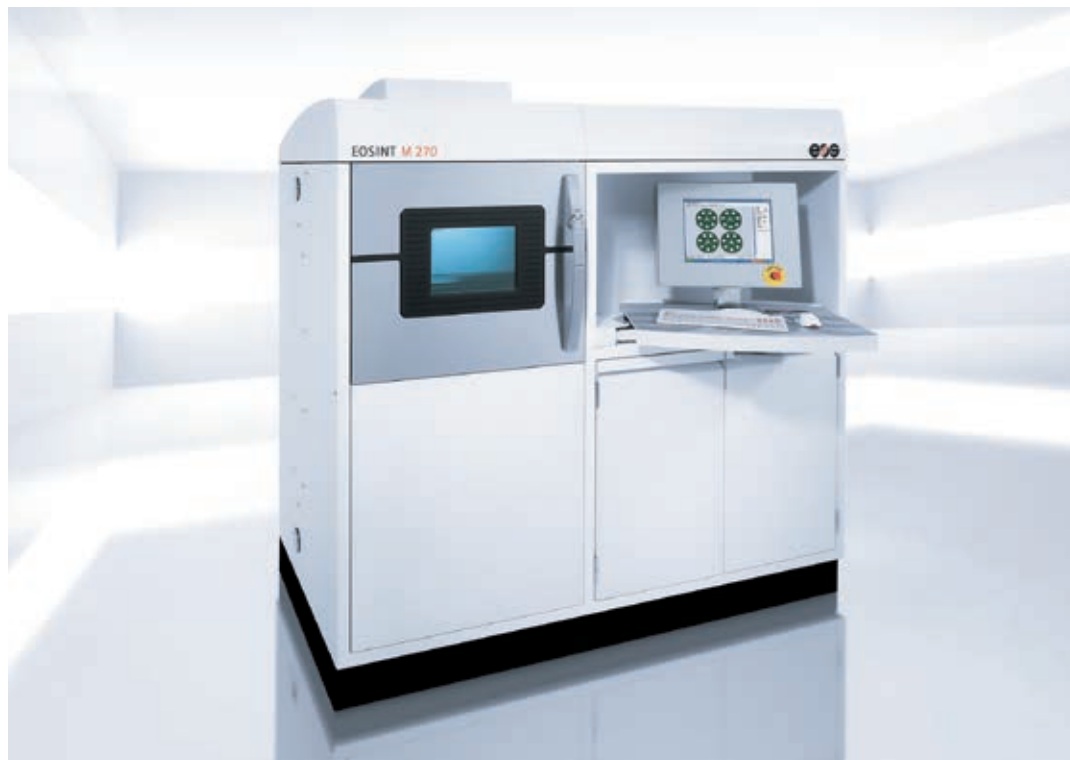
Fig.9: EOSINT M 270: System for Additive Manufacturing of crowns and bridges as well as removable partial dentures directly from electronic data

The system is established on the market and manufactures crowns and bridges as well as removable partial dentures by Direct Metal Laser Sintering (DMLS). The fibre laser in the EOSINT M 270 achieves accuracies of +/- 20 µm. Thanks to the controlled material fusion, the dental prosthesis that is produced is homogenous, of a constantly high quality and of a higher quality than cast parts.