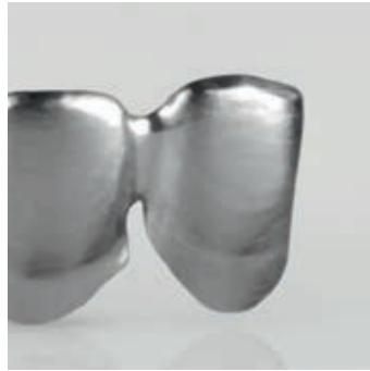
Fig. 1: Dental bridge