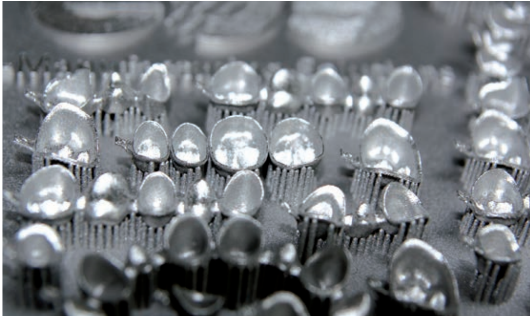
Fig. 5: Productive: A building platform can be charged with up to 450 units