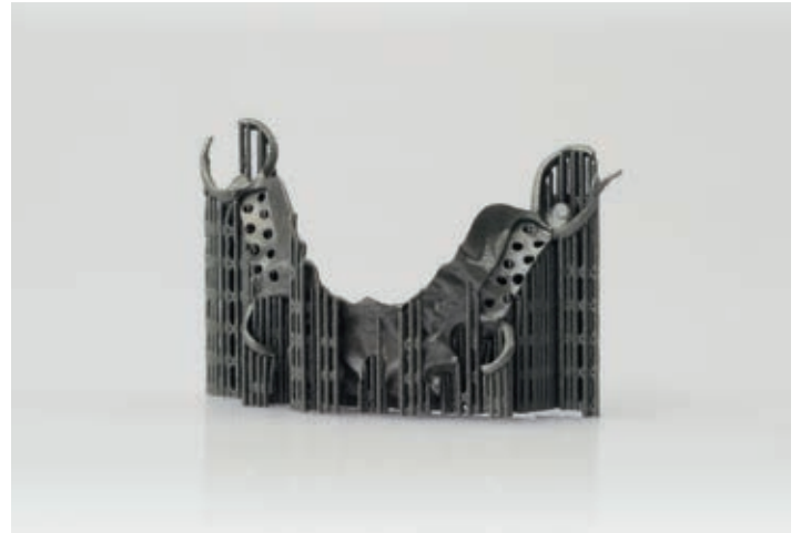
Fig.12: Removable partial denture with support structures made from EOS CobaltChrome RPD

The pigment-filled polyamide-12-powder has a colour similar to that of plaster. The familiar colour contrast to dental restoration and the high mechanical and thermal resistance permit an optimum check of the fit as well as veneering of the dental prosthesis.